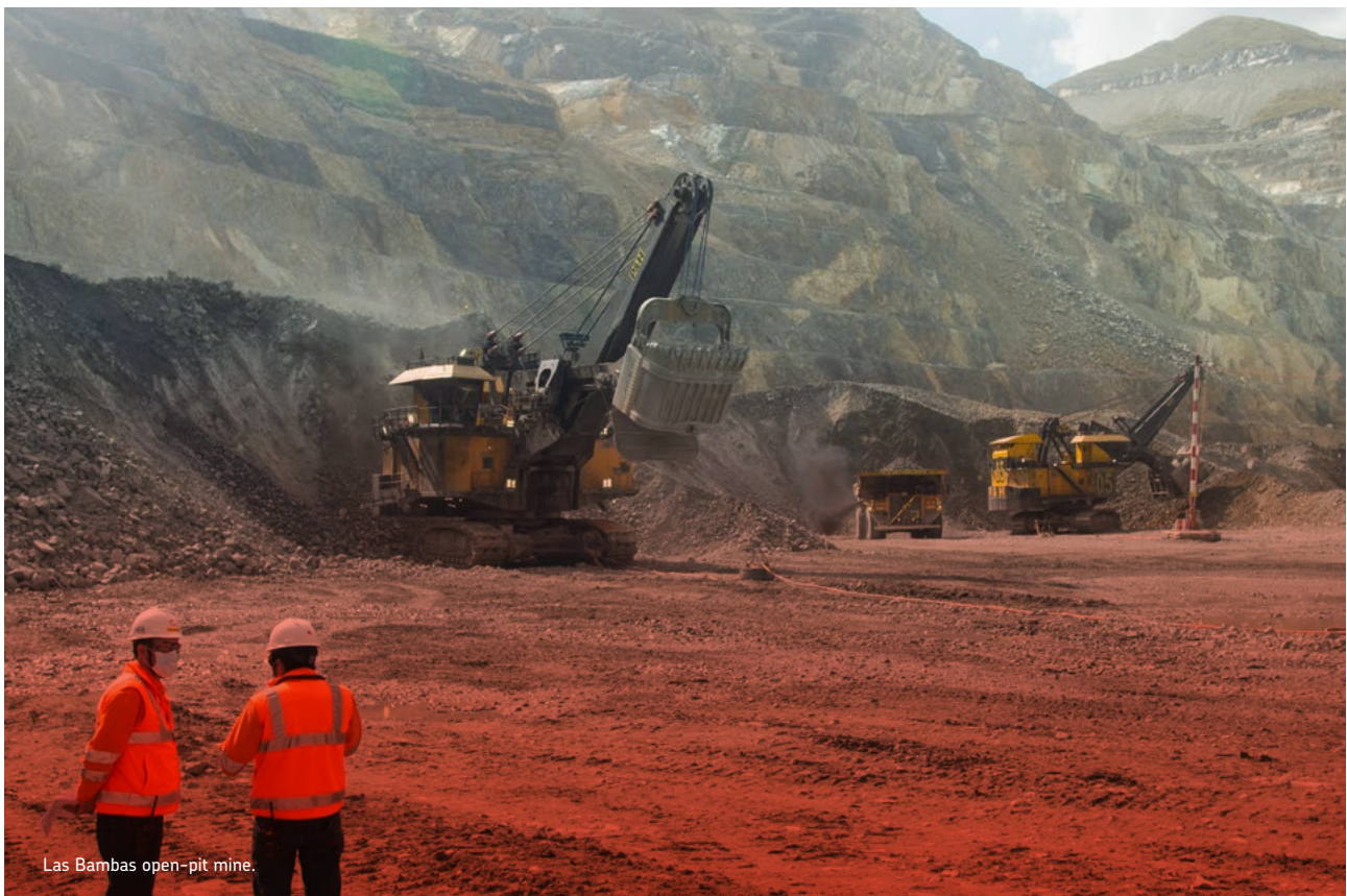
Las Bambas open-pit mine.

MMG also undertakes an annual risk and assurance review to determine that its policies and procedures are being complied with. This includes a review of MMG's engagement with outside parties, including suppliers, and the proper conduct of supplier due diligence. MMG implemented a requirement in 2020, for supply chain contracts to include clauses that enable MMG to review its suppliers' compliance with applicable modern slavery laws. During 2021 there was no concerns identified.