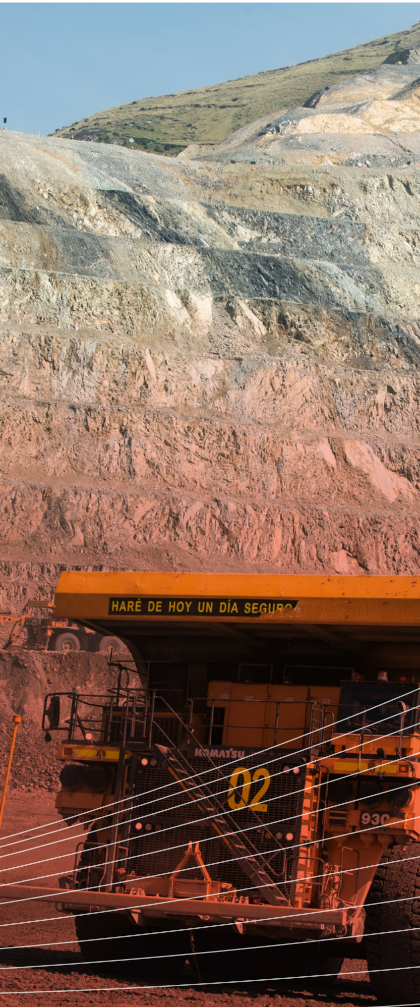
Cover Image: Overview of Rosebery mine. IC Image: Las Bambas open-pit mine.